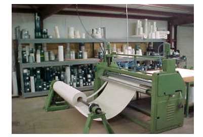
Wide Belt Slitter