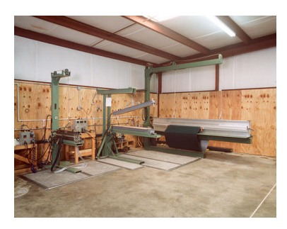
Conveyor Belt Presses