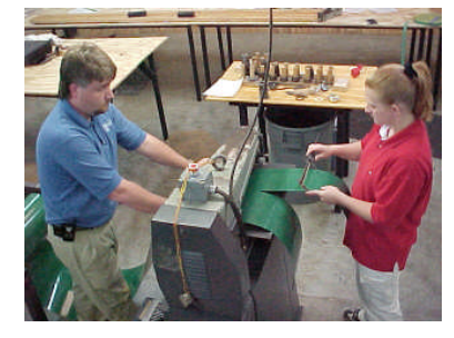
One of many narrow slitters